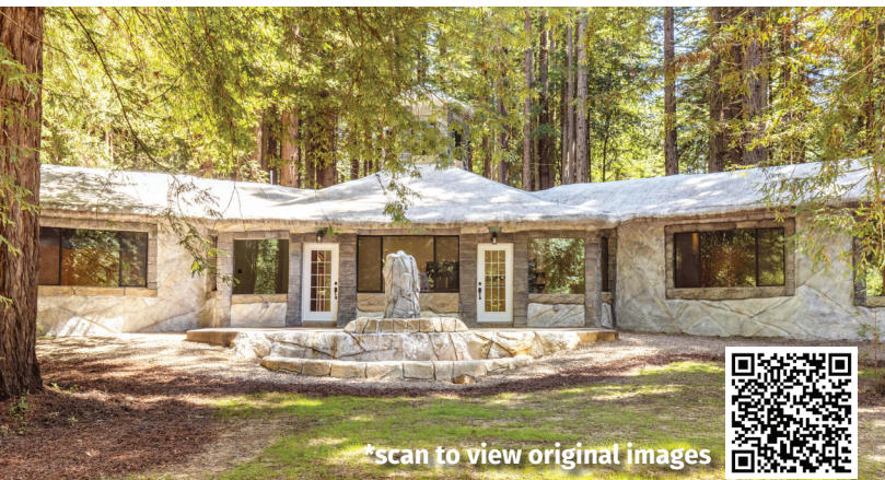
*scan to view original images